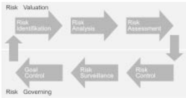
Fig 2. Elements of risk management

both forward-looking and in line with the progress of the project, since before the start of the project not all risks are completely recognizable and during the project implementation further risks may emerge. Fig 3 provides an overview of various methods for identifying risks. In principle, creative and guided methods are distinguished. The first type offers the possibility also to discover new kinds of risk. Guided methods use such as checklists for identifying risks, with the aid of which the conceivable types of risk are checked.